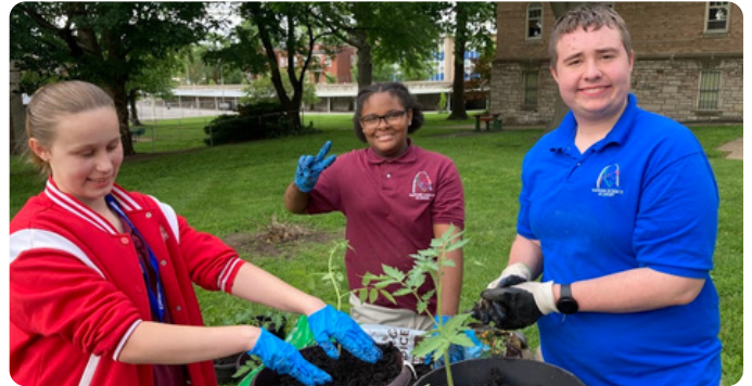
Youth volunteers planting tomatoes in the garden earlier this spring. We can't wait to give them out!