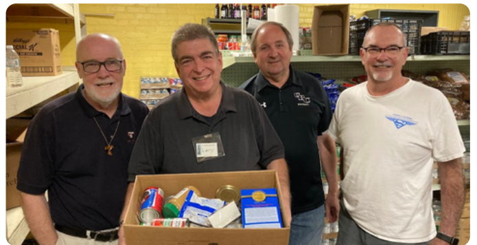
Our dedicated volunteers are filling boxes of food