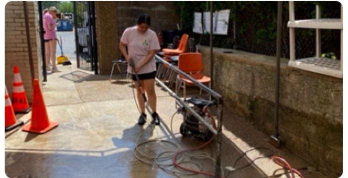
Students giving the entrance ramp a much needed power washing!